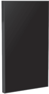
Single Video Wall