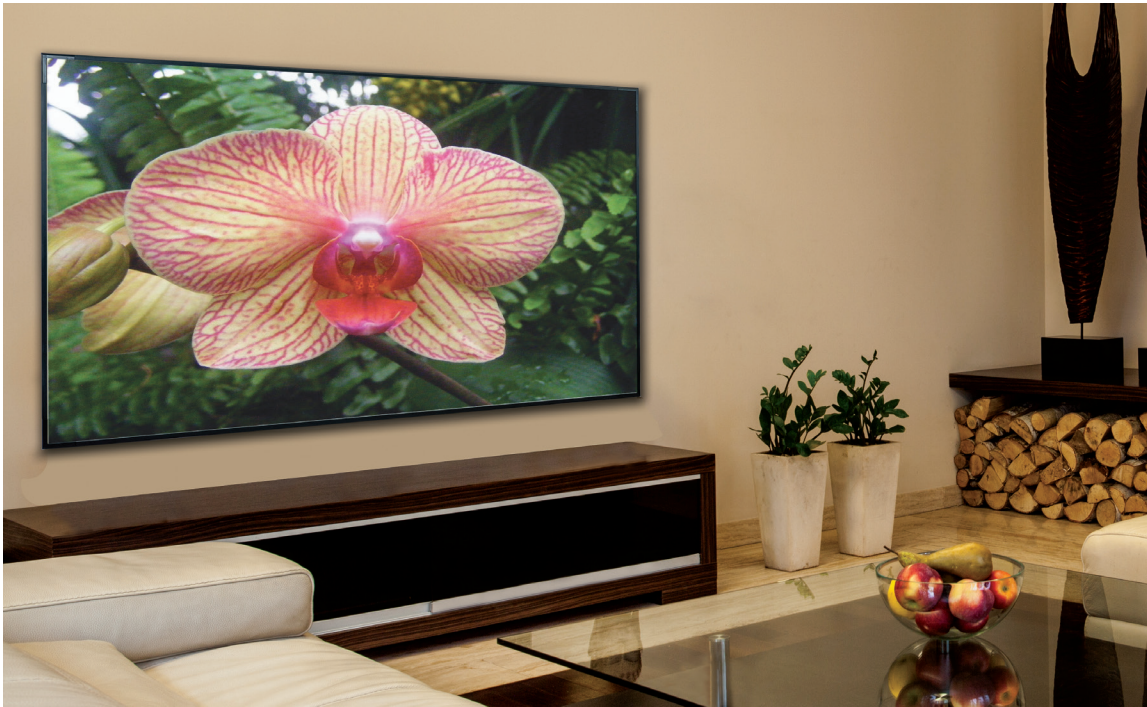
Framed bezel option